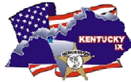
Blue Knights Kentucky Chapter IX